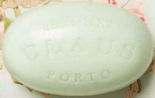
CLAUS PORTO PASTILLA DE JABÓN MADRIGAL SOAP (10,50 €, EN ISOLEE.COM).