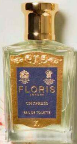
FLORIS PERFUME CHYPRESS (78 €, EN ISOLEE).