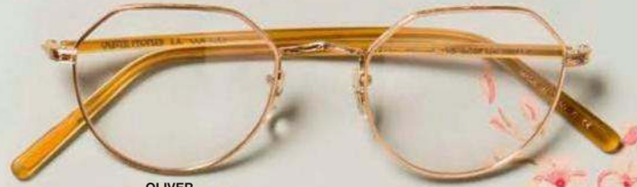
OLIVER PEOPLES GAFAS DE METAL.