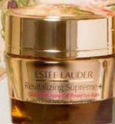
ESTÉE LAUDER CONTORNO DE OJOS REVITALIZING SUPREME+GLOBAL ANTI- AGING CELL POWER (68 €).